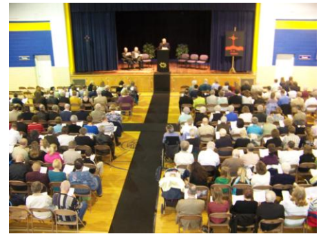
Let's pack the gym at our upcoming 125 th events like we did for the 2009 Good Friday Service. Over 500 people worshiped together in the TLS gym.

Mid-Winter Tournament weekend is a great time to come back home and see your "old" Trinity friends. This coming school year we will have many other opportunities to reminisce and celebrate at Trinity. Put the dates from our What's Happening column on your calendar, and plan to join us. We'd love to see you!