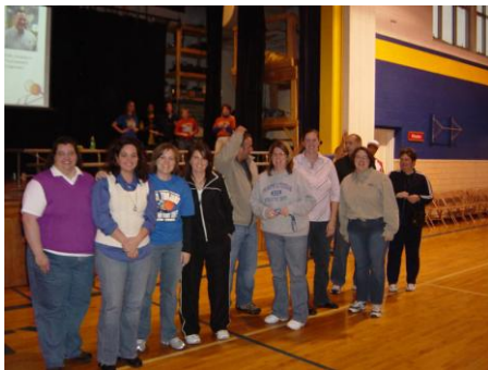
TLS Alumni from the "80's"

View the Prayer Garden design and print off a brick order form at the church's website: www.trinitycr.com .