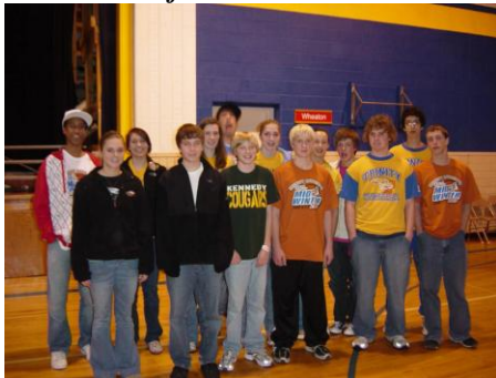
TLS Alumni from the "2000's"